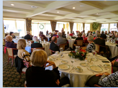
The enthusiastic audience